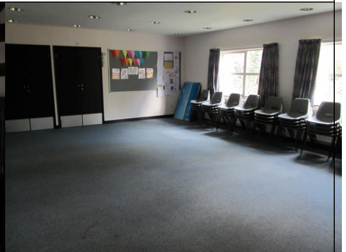
Hicks Lounge Approx 8 x 6 metres Carpeted Floor Approx 20 adult chairs available for use