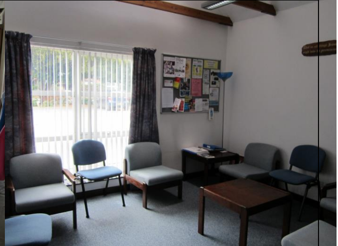
Quiet Room Approx 4 x 4 metres Carpeted Floor Approx 6 armchairs and 4 upright chairs available for use