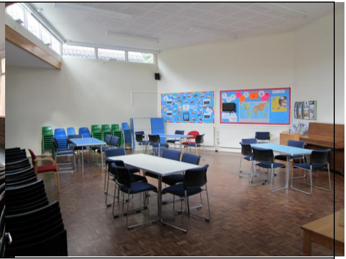
Pentagon Approx 10 x 7 metres Parquet woodblock floor Approx 30 adult chairs, 20 children's chairs and adult and children's height lightweight folding tables (Gopak) available for use