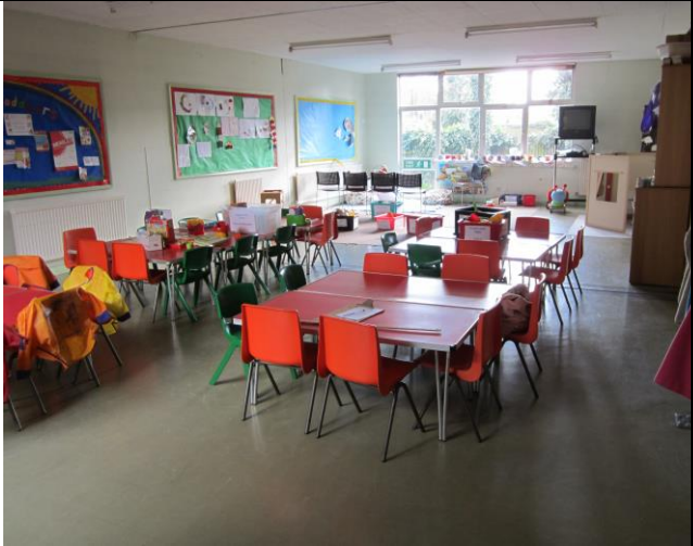
Divided Room Approx 13 x 6 metres Vinyl flooring Approx 10 adult chairs, 20 children's chairs and 6 children's height lightweight folding tables (Gopak) available for use