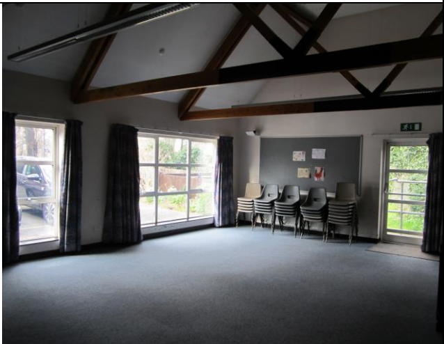
Baldwin Room Approx 8 x 6 metres Carpeted Floor Approx 20 adult chairs available for use